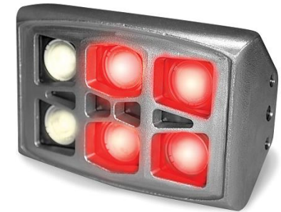
Cubex IS Lights