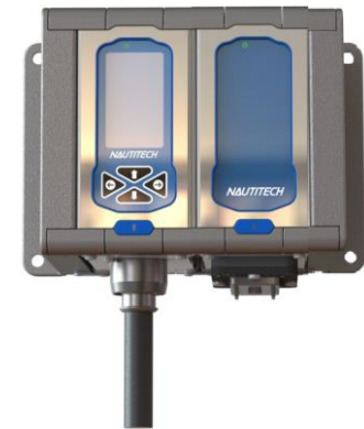
CUBEx IS Power Supply (PSM) + Light Interface Module (LIM)